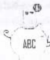
Transfer of Credits